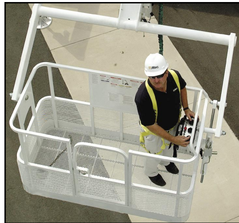
Optional 2-Man Platform