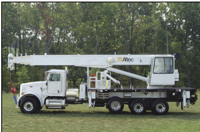
Vehicle Travel Height of 12.9 ft (3.9 m)

Ontario Service Center 831 Nipissing Road Milton, Ontario L9T 4Z4