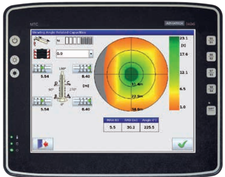
On-board planning simulation with IC-1 Plus control system