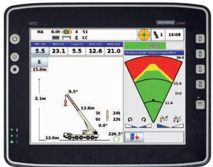
Capacity Radar IC-1 Plus