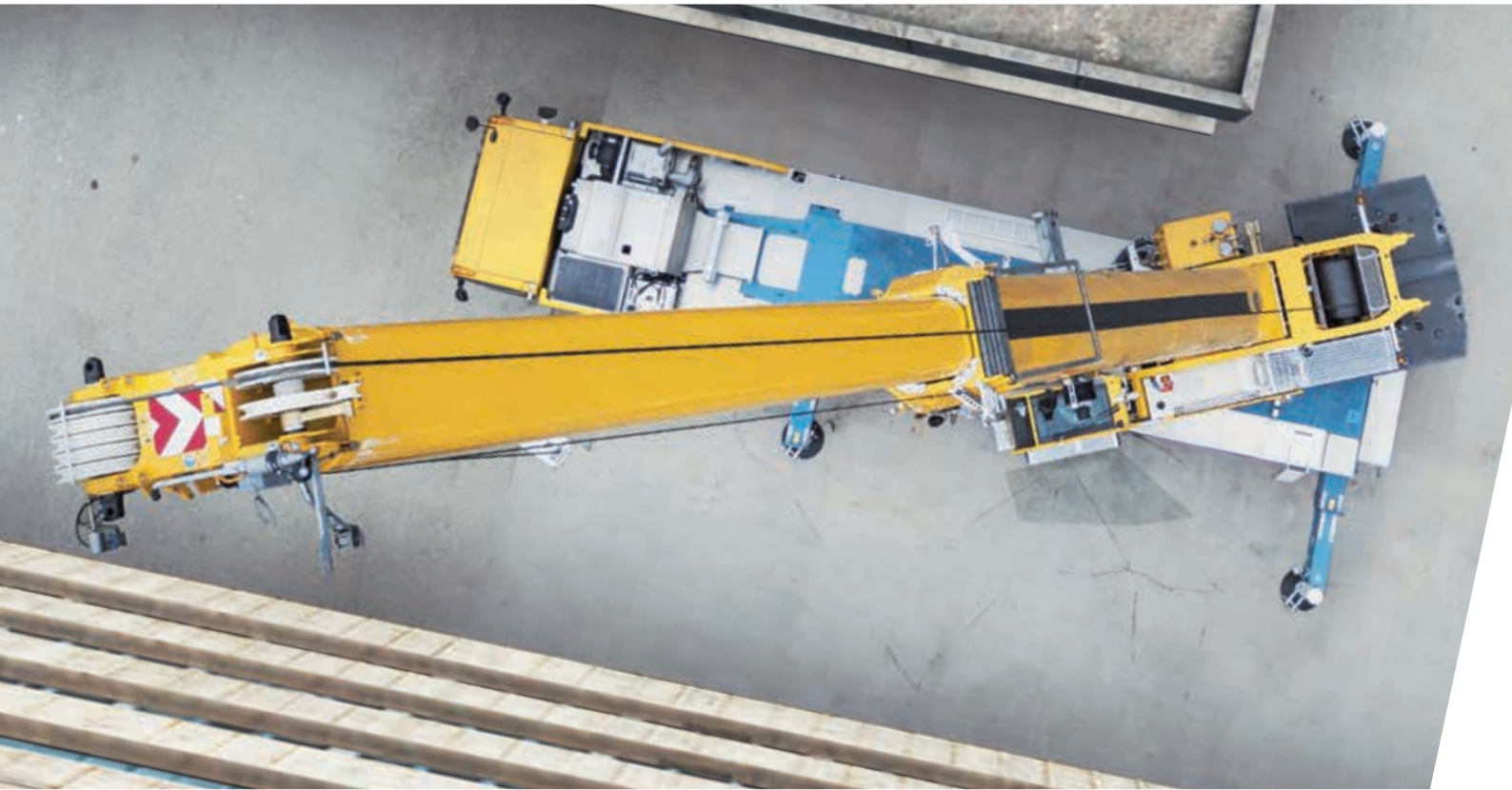
Asymmetric outrigger setup for confined spaces