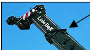
A-max extends only the inner-mid section of the boom for substantially increased capacities for in-close, maximum capacity lifts.