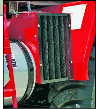
Transmission oil is cooled by a thermostatically-controlled oil cooler to provide maximum cooling under the most extreme job conditions.