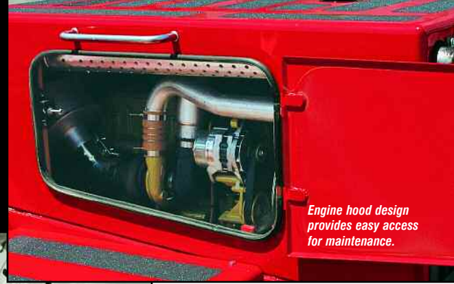
Engine hood design provides easy access for maintenance.