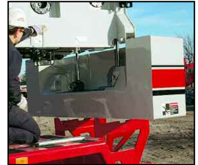
Fast & efficient hydraulic counterweight removal enhances roadability