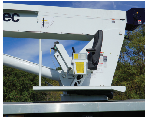
* This feature is not standard equipment for the AC38-127S.